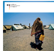
Employment Promotion in Contexts of Conflict, Fragility and Violence Opportunities and Challenges for Peacebuilding